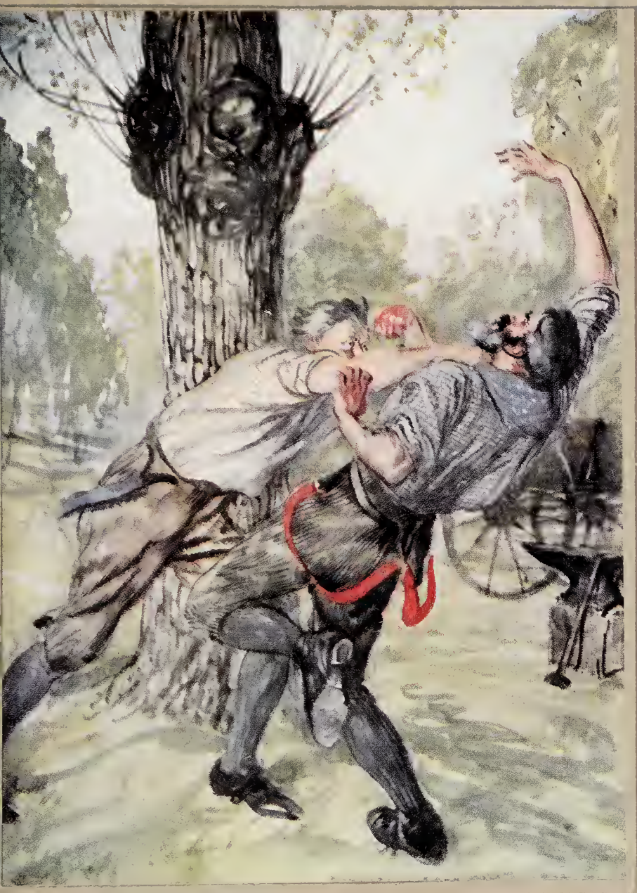
"THE BLOW WHICH I STRUCK THE TINKER."